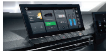
10.25" Touch Screen