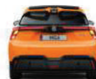
Rear wheel track 1551mm