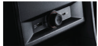
USB Type - C Charging Port