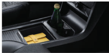
Central Double Level Area