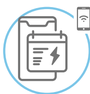
Set schedule charging