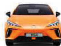
Front wheel track 1550mm