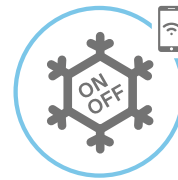
App remote control