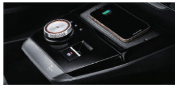
Floated Central Control Platform