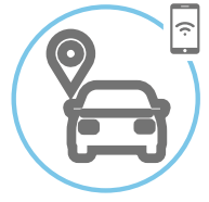
Find your vehicle