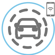
Vehicle status diagnosis