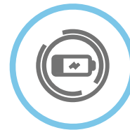
Range visualisation and charging point